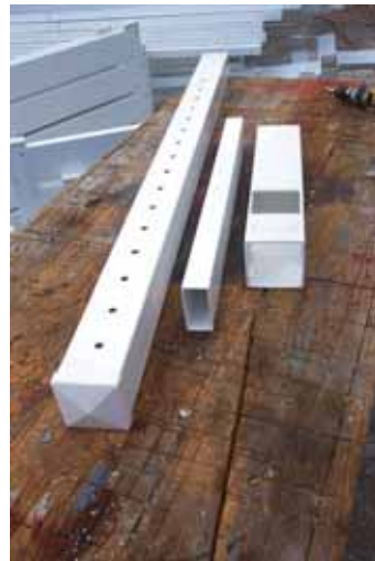
Pieces fit perfectly, sliding into precut pockets.

In 1985, I found that most jumps available were over-priced or of poor quality. I started building my own just for personal use and for friends. After I had built a couple different models, I took some of my jumps to the Sonoma County Fair and was approached by riders who saw them on display. They were pleased with the quality and cost. This led to creating West Coast Jumps which flourished due to my customers' interest and continued demand. I owned and ran West Coast Jumps until last year.