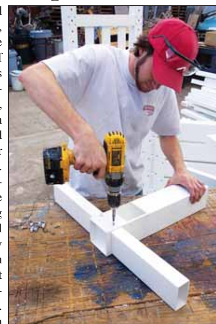
Assembly is easy: All you need is a screwdriver or cordless drill.

terial called Duralon, a unique blend of polymers that is superior to wood, which can rot and splinter during use. It adds flexibility while maintaining exceptional integrity and strength against breaking under impact. Duralon also offers a tremendous resistance